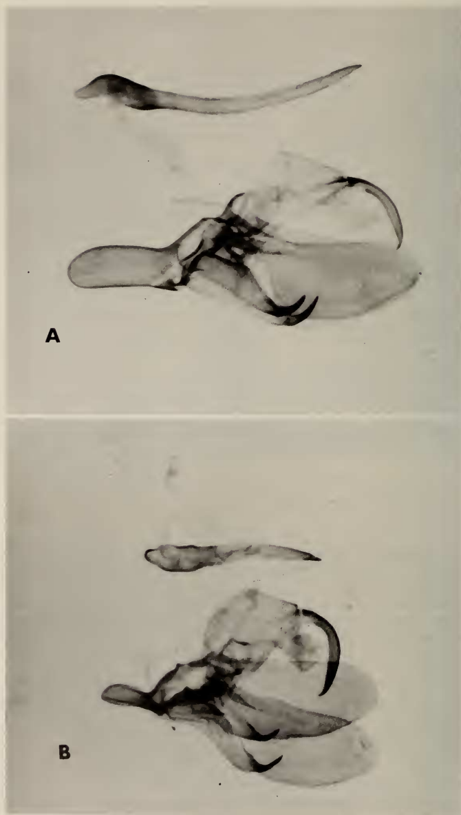
FIG. 2. a, Eumorpha pandorus , ♂ genitalia; b, Eumorpha intermedia , ♂ genitalia.